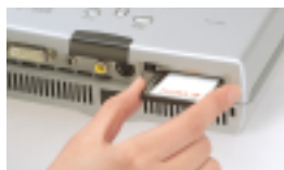
Image Viewer function: Projection of image files and PowerPoint files containing animations is possible even without a PC. PC-free presentations can be made simply by inserting the CompactFlash card into the U4-237's CompactFlash slot. Minutes or ideas written on PLUS's M-series Copyboard can also be projected on the large screen by storing the written data on the CompactFlash card.

Presentation timer: Indicates the remaining presentation time on screen, and allows you to manage time without keeping an eye on your watch.